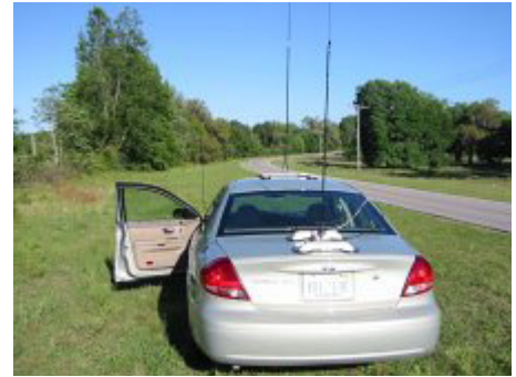
W1NN Mobile Antenna setup

whole lot more than just provide a photo op, though. Amazingly, he flew in with a "suitcase station" and set up a rental car