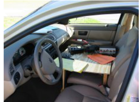
W1NN Rental Car Mobile Setup

for his effort. With 2059 QSOs, Hal is the first ever FQP mobile entrant who drove himself around to average more than 100 QSOs per hour for our 20-hour event! On top of that, his logging accuracy is admirable with only 16 errors for an error rate of 0.77%. Working 68 multipliers on CW, Hal's hastily-assembled station topped all of the single-op mobiles, tied the N4TO multi-op team, and was only one behind the W4OV/N4BP team that found 69 CW mults. W1NN is no stranger to the FQP, having accomplished the neat feat of the earliest sweep in 2004 despite being CW-only.